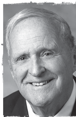
PROF. VICTOR VROOM USA